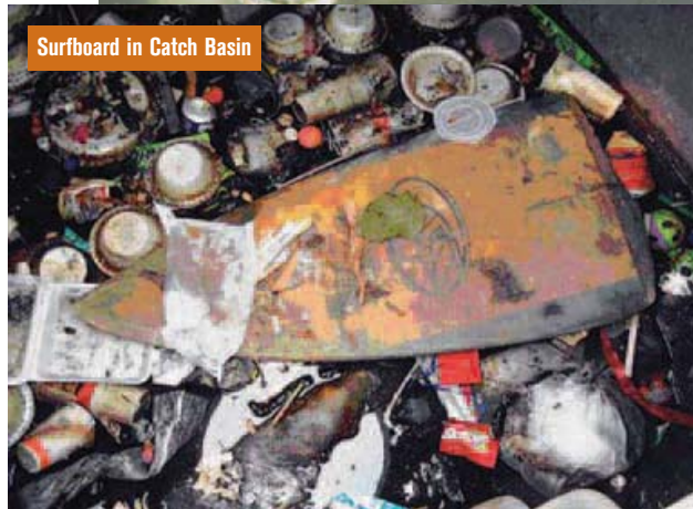
Surfboard in Catch Basin