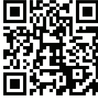
For more photos

Our two STEM Days were a huge success! Students and their families had a great time with their activities and enjoyed working with the amazing Engineers! To name a few, students had a blast learning how to construct a parachute, catapulting a marshmallow, and building a solar car! Mahalo to all the engineers from Brown and Caldwell, Yogi Kwong Engineers, and Limtiaco Consulting Group.