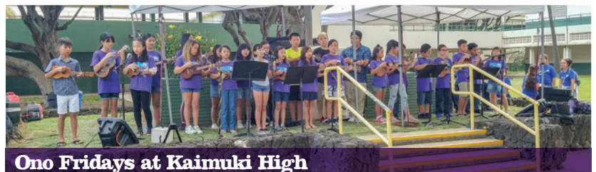
Ono Fridays at Kaimuki High