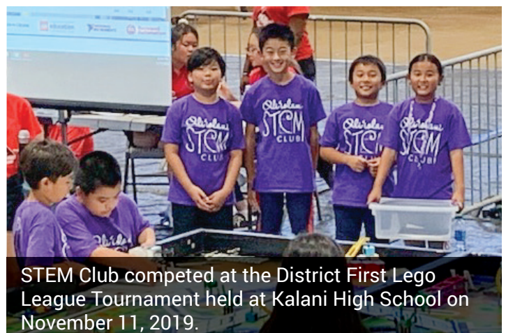
STEM Club competed at the District First Lego League Tournament held at Kalani High School on November 11, 2019.