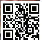
For more photos