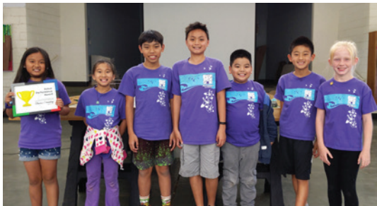
STEM Club brought home Robot Performance Award from the Kalihi Kai Robotics Invitational held on April 6, 2019.